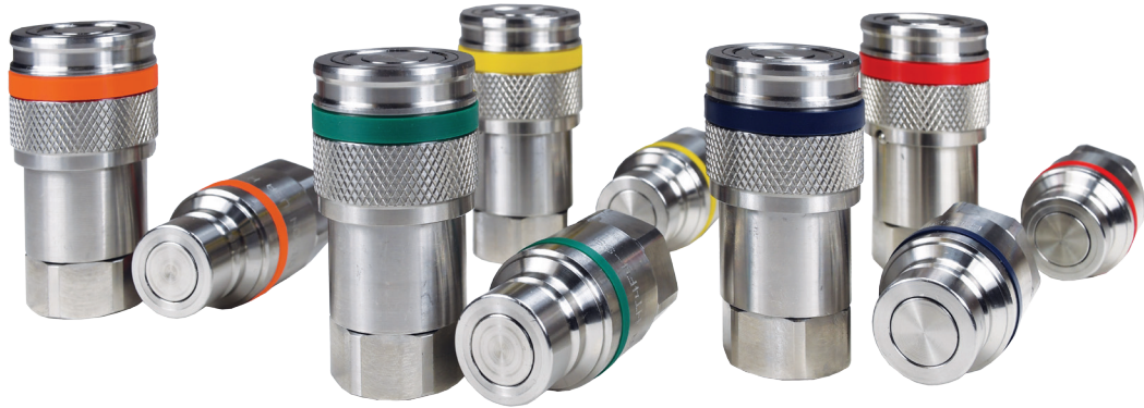
Correct Connect™ shown on HT-Series couplers and plugs.