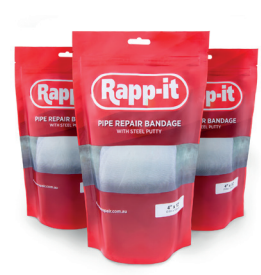
Rapp-it Pipe Repair Bandage