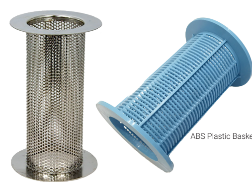
316 Stainless Steel Basket