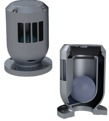
Air Pipe Head