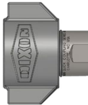
WS Coupler With Wrench Flats Example * Wrench flats may result in reduced pressure performance.

FOR TECHNICAL GUIDELINES PLEASE REFER TO PAGE 259